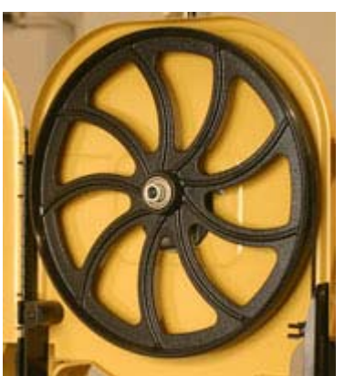
The motor (left) is pre-installed in the enclosed base and sends its power through machined pulleys and an ultra-reliable Poly V-belt. The 9-spoke cast iron drive wheels (right) are fully machined, painted and fitted with tires before being dynamically balanced.

a flywheel effect that stabilizes blade speed when the cutting gets tough.